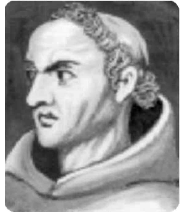
William of Occam